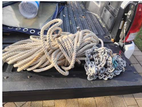
200' 3-strand 3/4" - 20' Chain