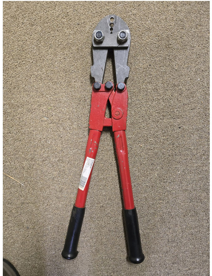
1/16 thru 3/16 Swaging Tool