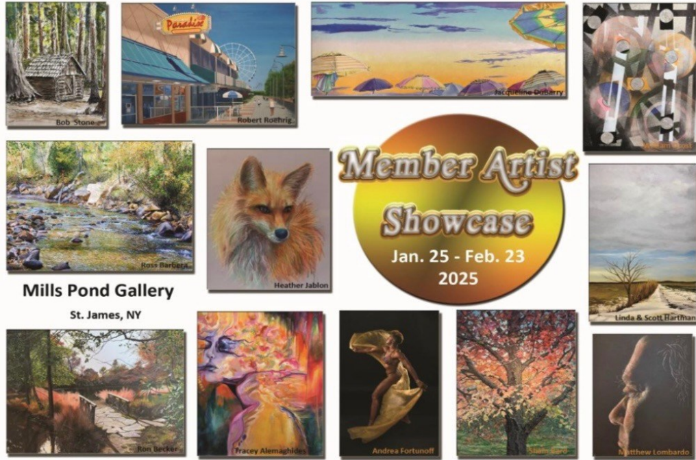
Mills Pond Gallery St. James, NY

Join us - Member Artist Showcase Opening Reception Sat. Jan. 25 1 - 4 pm